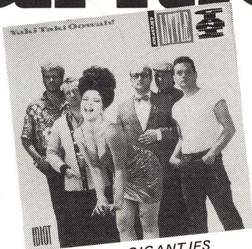
GIGANTJES 'Yaki Taki Oowah!'